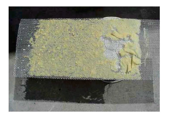
Screen of 1/8-in. Mesh Opening Obstructed by Cal-Sil (Small Yellow Lumps) and Fiberglass (Uniform Translucent Mat). Close Inspection Reveals Very Small to Microscopic Cal-Sil Granules Imbedded in a Complex Fiber Mat. The Broken Bed to the Right of the Photo Was Damaged During Screen Removal. Nominal Fiber Thickness is 1/10-in.

coatings (i.e., paint) off adjacent piping, equipment and structures. After creating debris, the water transports it to the containment sump.