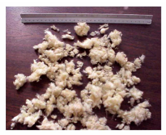
Typical Nukon fiberglass insulation debris used in transport testing.